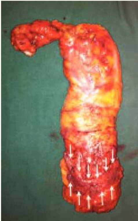
Fig. 9 – Specimen with indication of significant amount of levator muscles attached (white arrows).

The decision of performing a CAPE must be taken preoperatively based on staging information provided by imaging modalities. In this setting, MRI has proven to be efficient in differentiating those tumors amenable to be treated with surgery through excision of the mesorectal plane from those requiring dissection through the “extralevator plane”. 18