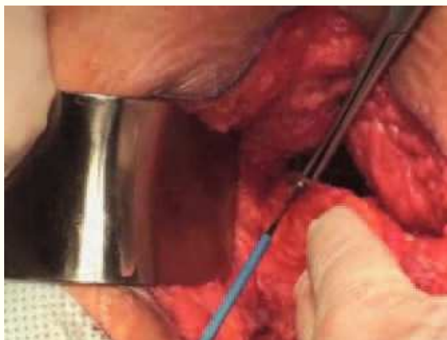
Fig. 5 – Transection of levator muscles under direct visualization.

Final specimen shows no “waisting” at the level of the anorectal ring. Instead, a cuff of extralevator muscles can be seen attached to the rectum (Fig. 8 and 9).