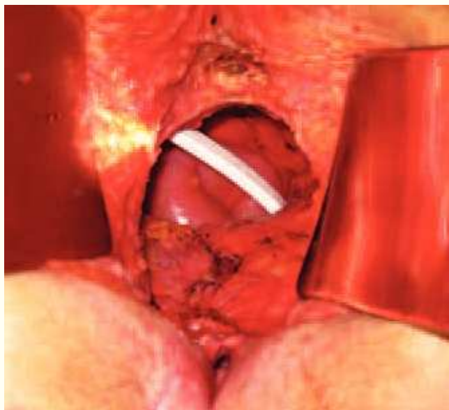
Fig. 6 – Perineal view after CAPE and closure of the posterior vaginal wall.