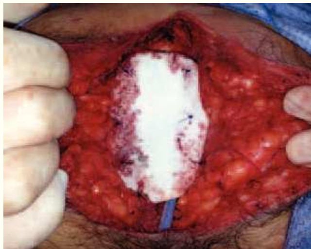
Fig. 7 – Perineal defect repair using a biological mesh after CAPE.

Indications for CAPE are the same of APE: tumors with direct invasion of the anal sphincter, distal rectal lesions in incontinent patients and impossibility to achieve a safe distal margin with a sphincter sparing technique. However, there is still controversy whether CAPE should replace standard APE or should be considered as an alternative approach for selected patients.