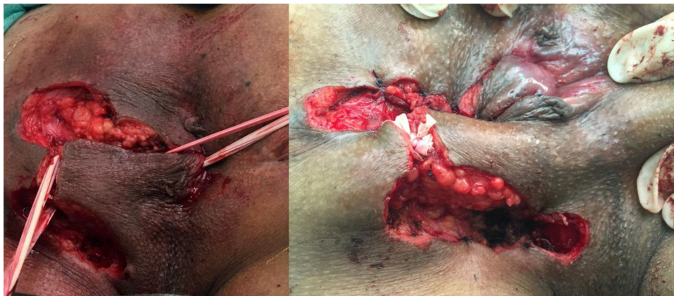
Fig. 4 - Identification of the internal orifice and placement of a sedge.