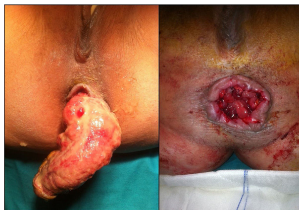
Fig. 1 – On the tenth day after the initial surgery, the exteriorized segment was amputated, and delayed coloanal anastomosis was performed.

A 55 year-old woman presented to our clinic with a 2 week history of constipation and rectal bleeding. A digital rectal examination revealed an irregular mass in the anal canal located 3 cm from the anal verge. The only significant aspect of the patient's prior medical history was hypertension.