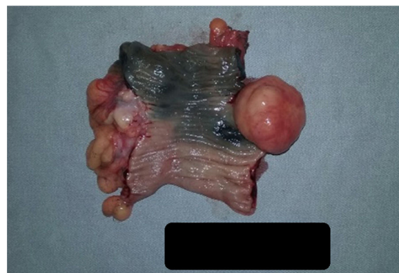
Fig. 2 – Surgical specimen.