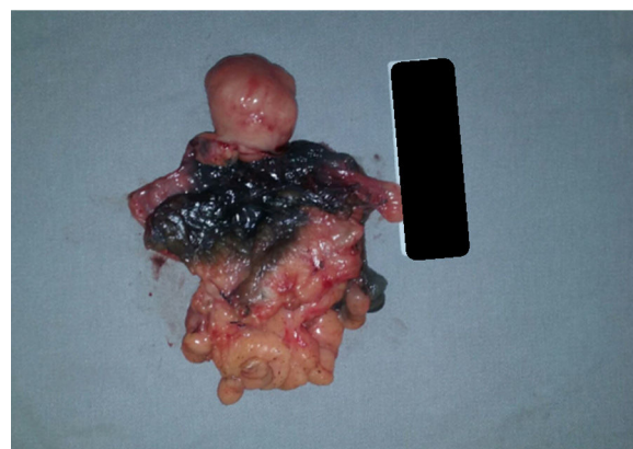
Fig. 3 – Surgical specimen.