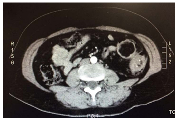
Fig. 1 – Abdominal CT with left colon thickening.