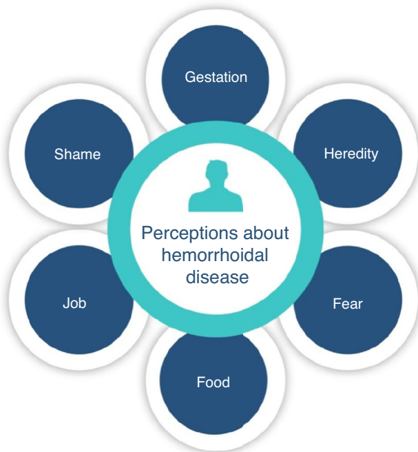
Fig. 3 – Perception of the patient about hemorrhoidal disease.

a limiting cause for achieving a plan of immanence, freeing patients from disease and decreasing its potency. 19,20