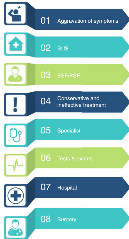
Fig. 4 – Trajectory of patients submitted to hemorrhoidectomy.

“I was lucky because it seems that some person was quitting the procedure; thus, they sent me over, in the place of that person.” (E9)