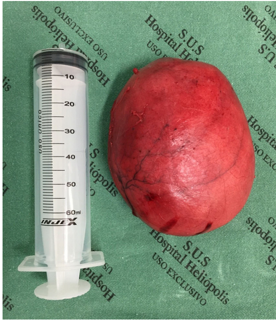
Fig. 2 – Surgical specimen after tumor resection.

increased number of mitoses (>2 mitoses per field, with a 10× increase). 3,9