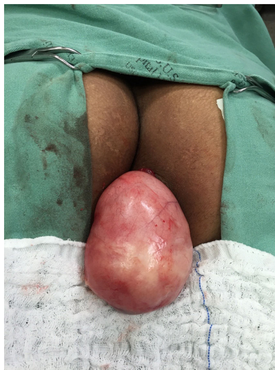
Fig. 1 – Patient in the ventral position with tumor extrusion from the perianal region on the right, near the anal verge.

First described by Virchow in 1854, and histologically confirmed by Malassez, in 1872, leiomyomas are benign tumors of mesenchymal origin and can develop where the smooth muscle is present. 3,5 They are more common in the female genital tract and skin. In the anorectal region, they represent only 3% of all leiomyomas of the gastrointestinal tract and less than 0.1% of rectum tumors, rarely found in soft tissues, mainly in