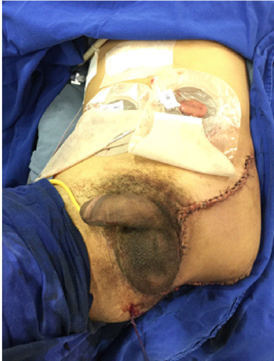
Fig. 3 – Final aspect after reconstruction with lateral thigh flap.