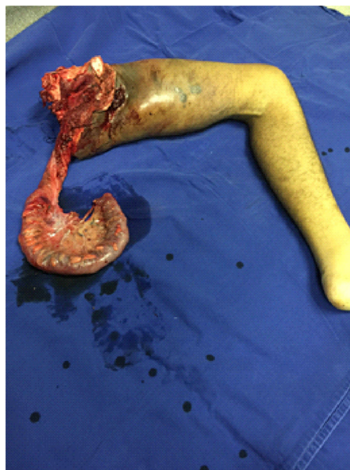
Fig. 2 – Surgical piece in monobloc.

The patient is being followed up in an outpatient setting, with no signs of tumor recurrence.