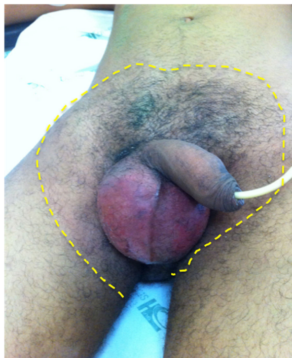
Fig. 1 – Signs of acute scrotum and red skin in the groins and low abdomen suggesting evolution to Fournier Syndrome.

Afterwards, laparotomy was performed and a perforated retrocecal appendix was found with diffuse peritonitis (Fig. 2). Appendectomy was performed and followed by abdominal cavity wash with saline solution.