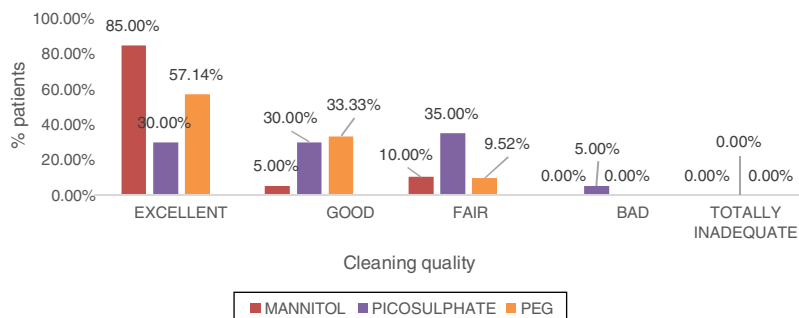
Fig. 1 – Quality of colonic cleaning.

The amount of water ingested in the 10% mannitol group was considered bearable by 9 (45.00%) participants, relatively bearable by 8 (40.00%) patients, and poorly bearable by 3 (15.00%) patients. For those who received macrogol, the amount was bearable for 13 (61.90%) participants, relatively bearable for 2 (9.52%), and poorly bearable for 6 (28.57%). In the group receiving sodium picosulphate, the amount of water was considered to be bearable, relatively bearable, and poorly bearable for 16 (80.00%), 2 (10.00%), and 2 (10.00%) participants, respectively. The difference was considered statistically significant ( p = 0.03 ).