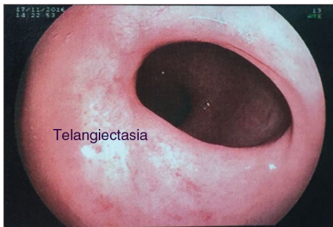
Fig. 3 – Endoscopic aspect of a patient with complete clinical response.

thus greater local and distance control, as well as better PFS and OS. 8 Considering this data, the real need for surgery in this group was questioned; Dr. Angelita Habr-Gama, from Brazil, was the first to conduct a study in order to elucidate this question and to experimentally adopt the wait-and-see policy (no surgical resection and vigilant follow-up).