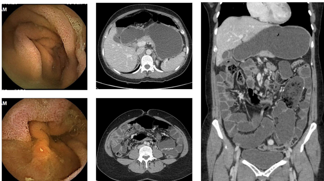
Fig. 2 – Capsule endoscopy and CT enterography images, 6 months after the acute event. Signs of pneumatosis are absent with few enteric stasis near the enteric anastomosis in CT enterography.

There are several theories to explain the secondary PCI pathogenesis 8 : mechanical theory, bacterial theory, pulmonary theory, and chemical theory. The mechanical theory suggests existence of air inflow through damaged mucosa, caused by intestinal obstruction, severe constipation, gastrointestinal ulcers, or intestinal necrosis, resulting in increased intestinal pressure. The bacterial theory suggests the invasion of gas-producing bacteria into intestinal submucosa, producing gas at the intestinal walls. The pulmonary